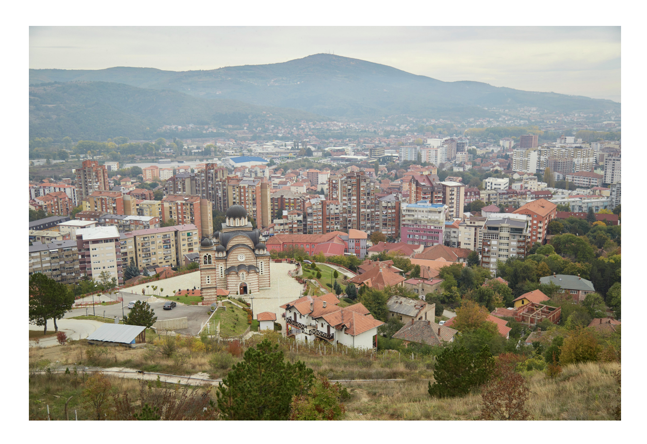
View of Mitrovica. The city is divided between ethnic Serbs and ethnic Albanians.

The situation started to change in 2013 due to an agreement between Belgrade and Pristina reached in Brussels that, among other steps, dismantled the parallel security structures.<sup>6</sup> This has given the Kosovar government and its executive structures a greater footprint in the region. Nevertheless, unresolved disputes between Pristina and Belgrade have resulted in