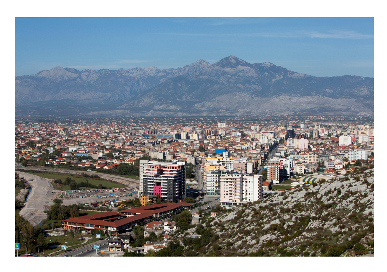
The custom of blood feuds is still present in parts of northern Albania such as Shkodra, pictured above.

However, recent research has shown that sometimes criminal groups apply their own version of a blood feud. According to the Kanun, you cannot take revenge for a family member who is killed while committing an immoral act (e.g., while stealing property). However, organized crime sometimes misuses the Kanun to exact