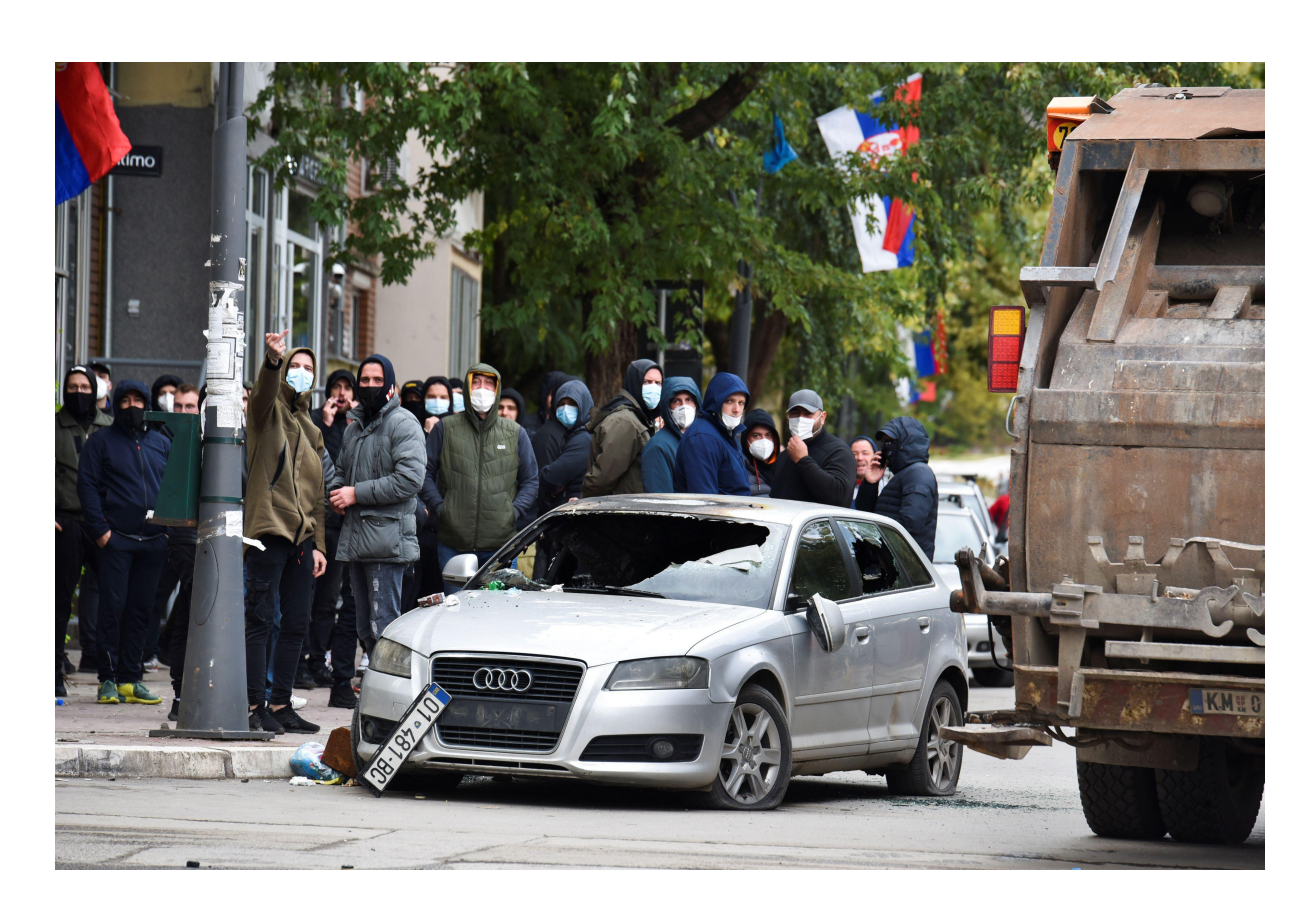
A damaged car following clashes between police and local protestors during an operation against the smuggling of goods, Mitrovica, 13 October 2021.

While past governments in Pristina have been wary of taking on the political economy of northern Kosovo, the government led by Prime Minister Albin Kurti has pledged to tackle organized crime and corruption. According to Kurti, since he took office in March 2021, there have been 437 police operations that have dismantled 31 criminal groups. 16