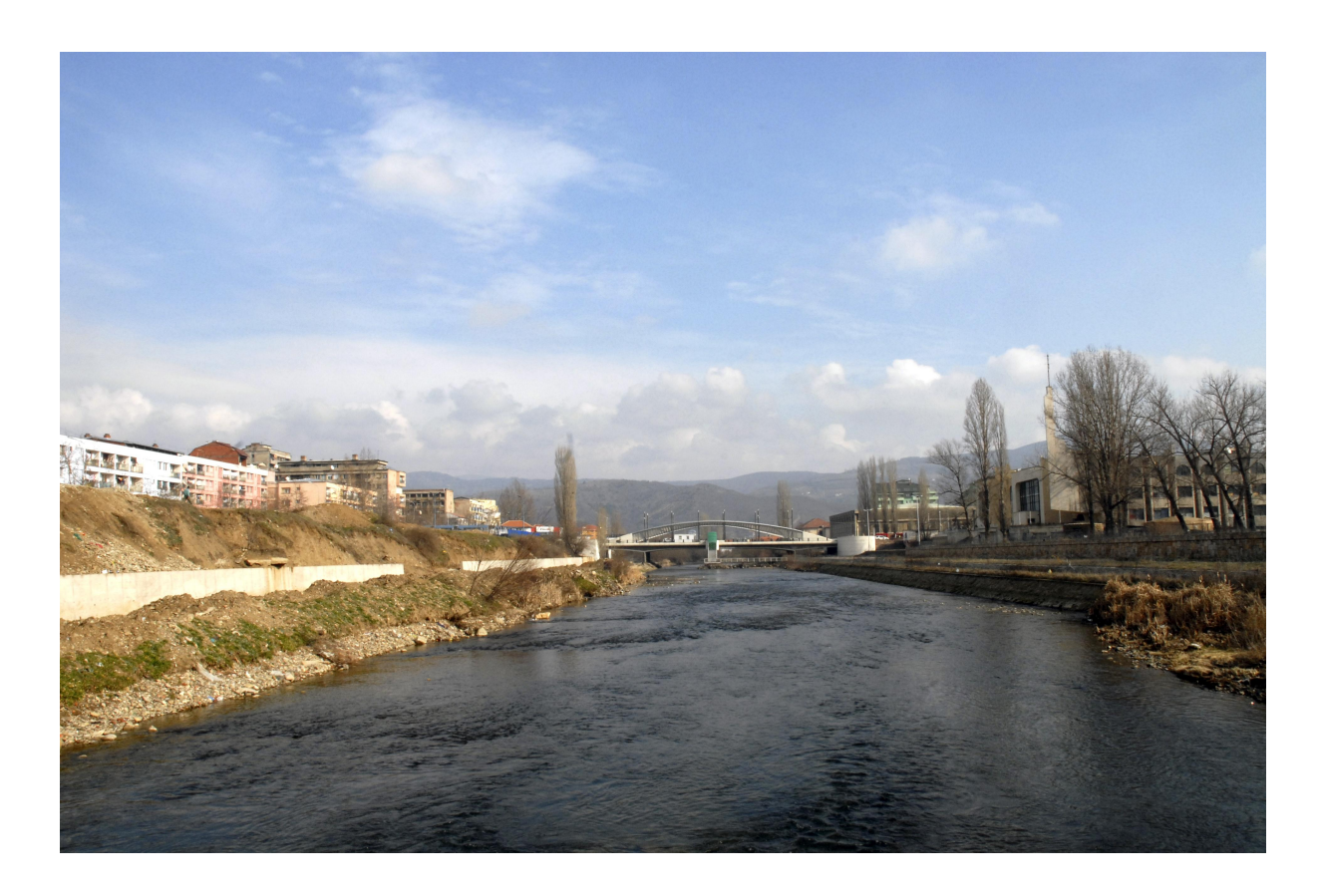
The river lbar separates predominantly Serb communities in the north of the country from Albanian ones in the south.

Politics in northern Kosovo is dominated by one political party, Srpska Lista, which has close links to the Serbian