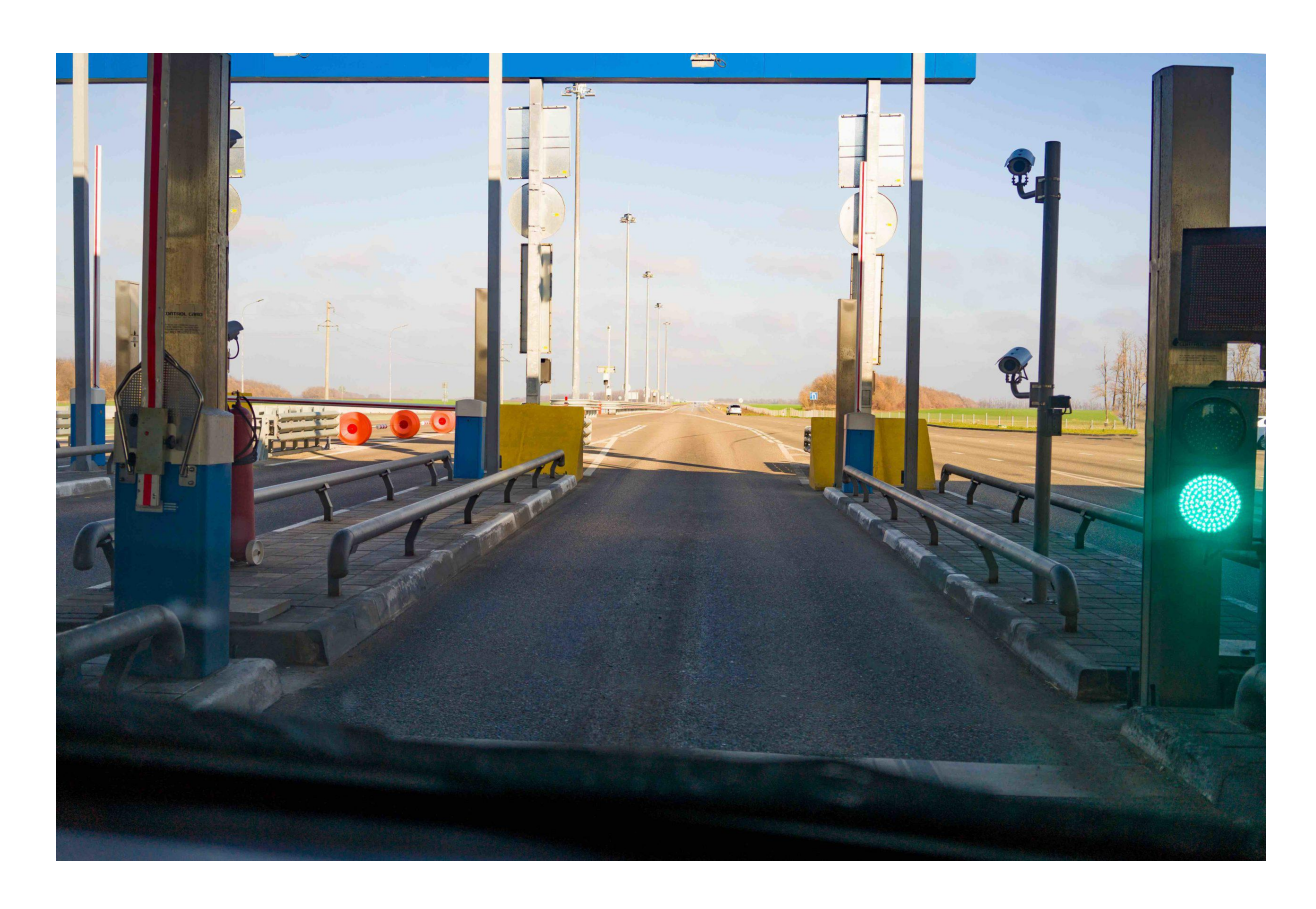
The Open Balkan initiative aims to remove all border obstacles between Albania, North Macedonia and Serbia.

The main aim of the Open Balkan initiative is to remove all border obstacles between the three countries by 2023. This would eliminate long and tedious waits for travellers and complicated paperwork for companies. Border crossings would remain, but fast lanes for citizens and goods coming from participating countries would be established at border points where no checks would be conducted. In addition, the leaders signed three documents on facilitating import, export and movement of goods, labour market access and cooperation in disaster protection.<sup>3</sup> As a result, goods and people will flow faster, a common market of 12