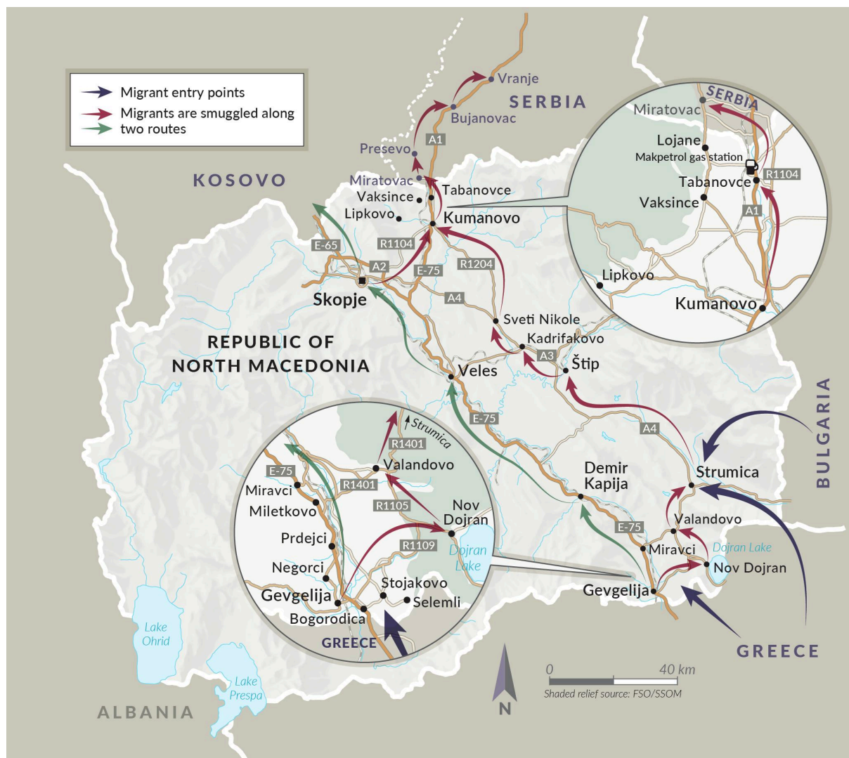
FIGURE 2 Migrant entry points and smuggling routes via North Macedonia.

The fee charged for smuggling migrants from Greece through North Macedonia and into Serbia is between €300 and €1 500, depending on the transport method, the quality of accommodation and other services. It is worth noting that this is around the same price charged in 2015 and until early 2016. Fees apparently jumped to as high as €3 500 in the period immediately after the Balkan route was closed. 12 Fees are usually paid either in advance in cash in one of the big Greek cities, to the driver or to the guide, or using money transfer services like the hawala system. 13