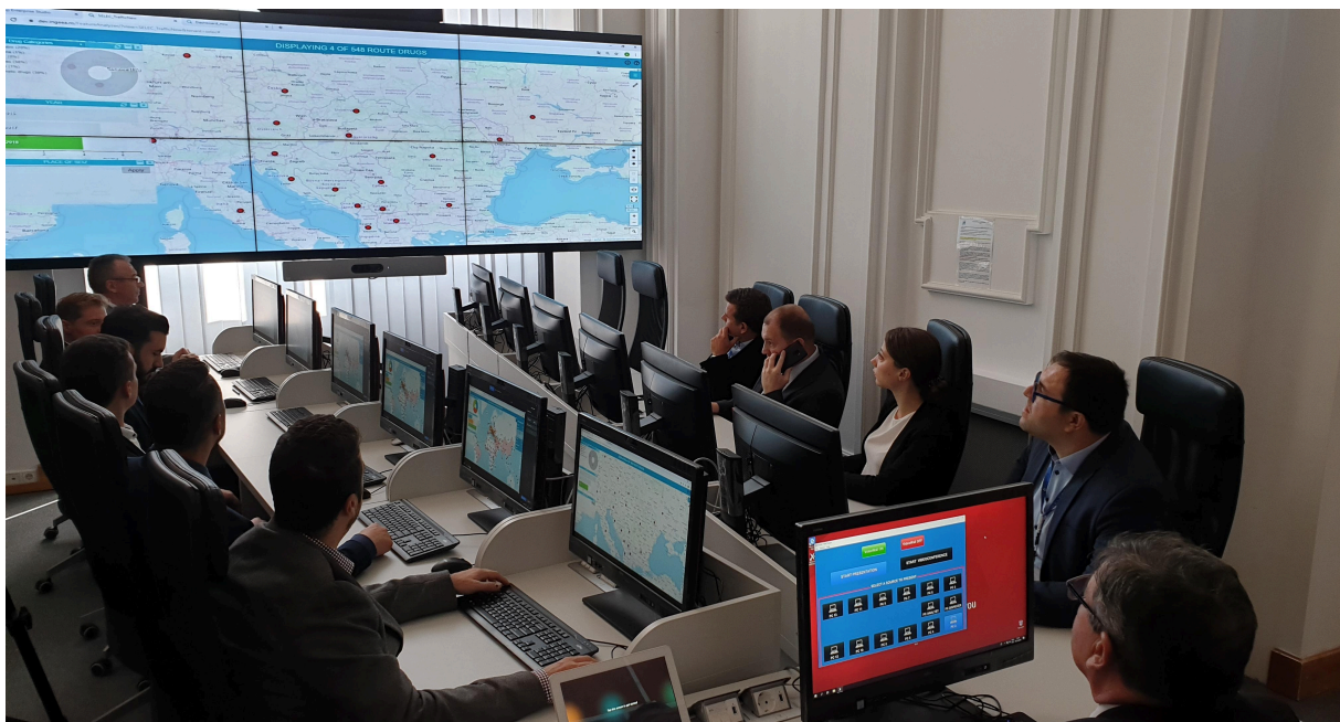
SELEC's Operational Centre Unit in action.

SELEC implemented a special project on strengthening the fight against firearms trafficking in south-eastern Europe from 2016 to 2019 to address these concerns.