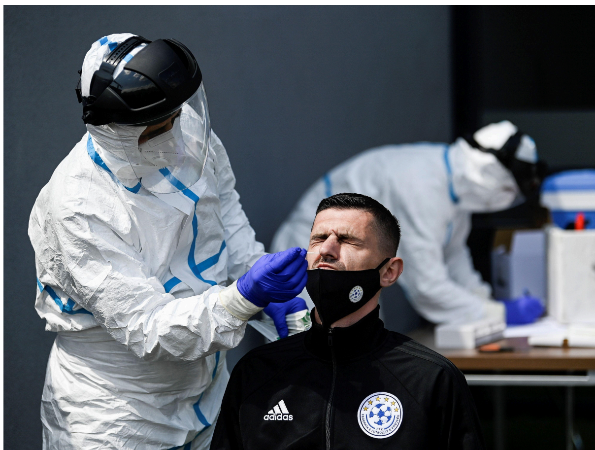
A football referee gets tested for COVID-19 in Pristina, Kosovo.

As in other parts of the world, consumers in the Western Balkans are vulnerable to fraudsters selling counterfeit medicines and masks, particularly online – a risk that could increase when a vaccine becomes available. There is also a fear that government