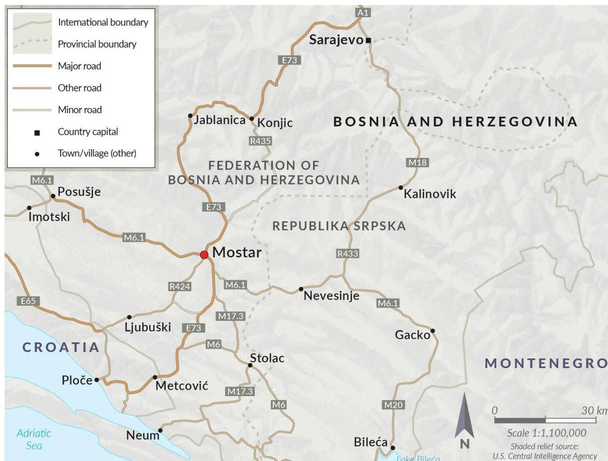
FIGURE 4 Mostar is situated along key trafficking routes.

You conducted a project to promote intercultural dialogue and inclusion through sports that involved war veterans of different ethnicities as well as former prisoners. How were you able to bring these people together and what was the result?