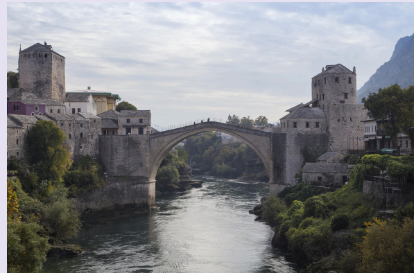
View of Mostar Bridge over the Neretva River. As well as a popular tourist destination, Mostar has become a hotspot for organized crime.

Some take advantage of their dual citizenship (for example with Croatia or Serbia) to evade capture or get a reduced sentence. Others operate with impunity thanks to corruption and weak prosecution. Criminal groups in the city are said to be involved in the trafficking of drugs, weapons and human beings. In